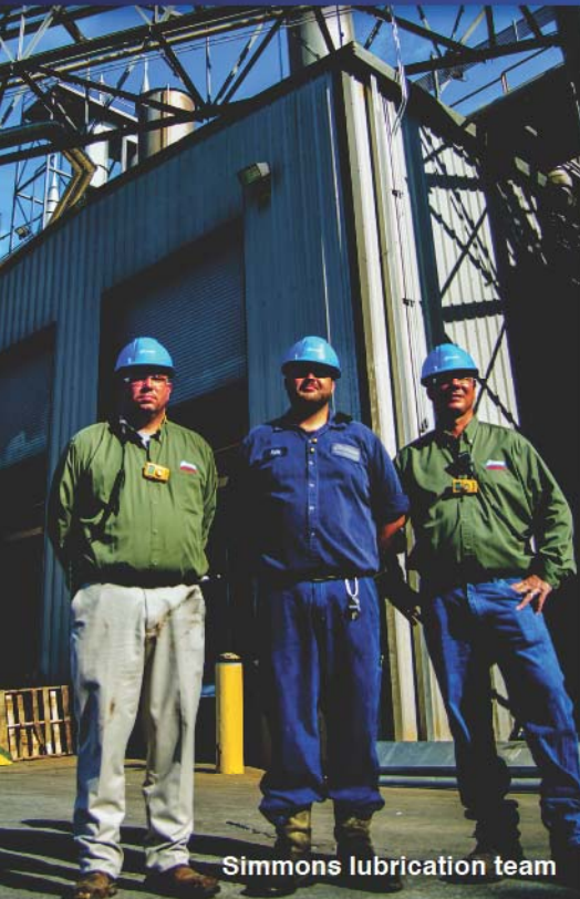
Simmons lubrication team