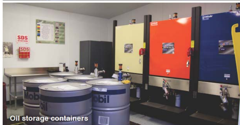
Oil storage containers

For more on Noria’s Lubrication Program Development, contact us at 800-597-5460 or visit Noria.com .